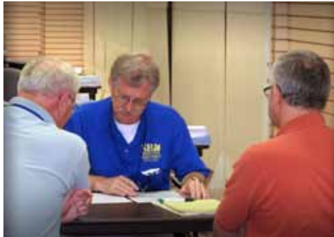
SBA is eager to answer your questions, discuss your concerns, and help you complete your loan application.